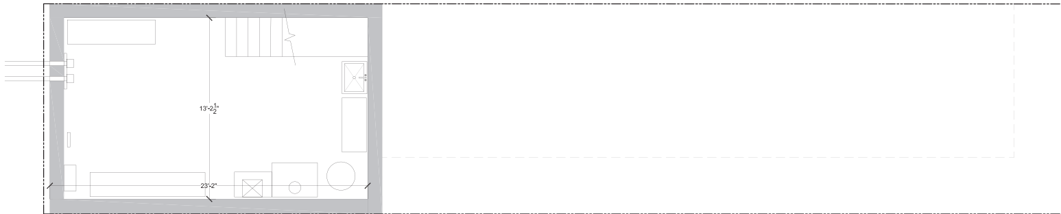
BASEMENT - 292 SF